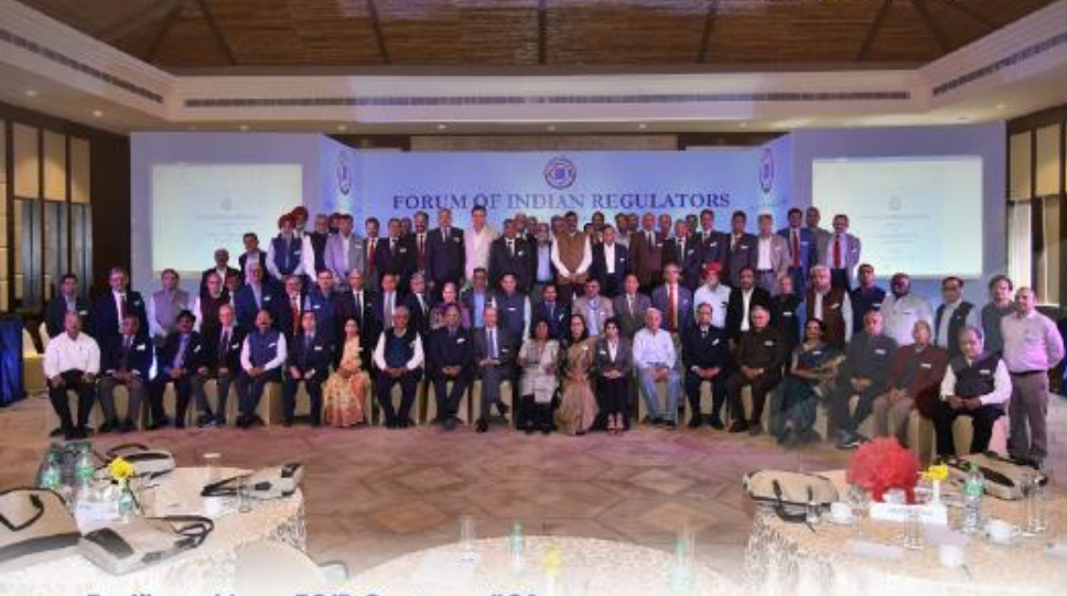
Facilitated by: - FOIR Centre at IICA

Message from the Chairperson - From the Editor's Desk - About FOIR and its Member Organizations - About FOIR Centre at IICA - Regulatory News and Trends - Articles - Events & Conferences -